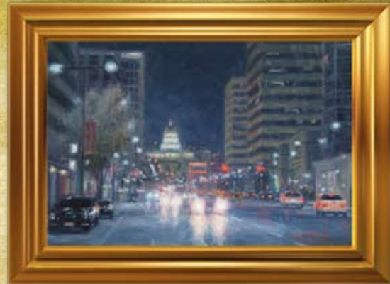
Bryan Mark Taylor North on State Size: 24" x 36" Medium: Oil on Canvas

The Gateway Aesthetic Institute features an extensive collection of original art available for sale. While many of the pieces hang in public view in our waiting rooms, an appointment is necessary to view additional art displayed in our private clinical rooms. To schedule an appointment, please call (801) 595-1600.