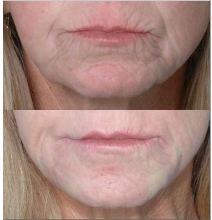
At right: This patient was treated with injections of filler, with impressive results.

Call us at 801-595-1600 for more information on this revolutionary treatment option. We'll help you reveal the most beautiful you, at every age! 🐾